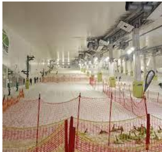
SNOWZONE Milton Keynes