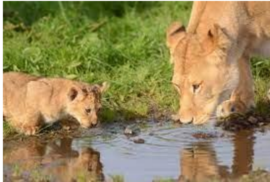
Woburn Safari park