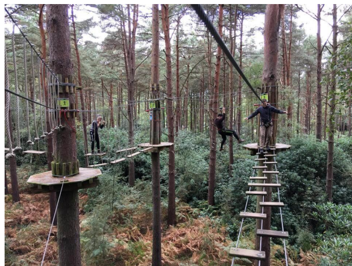
GO Ape Wendover Woods