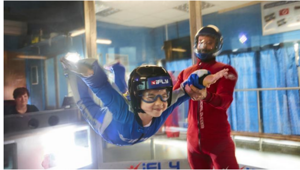
Xscape Skydiving Indoor Centre